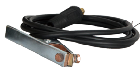
Earth Lead (6mm 2 +300A earth clamp)